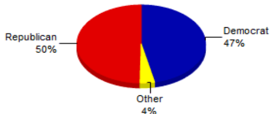
Chart 1. AVMA PAC Contributions by Party, (1/1/2021-12/31/2022)

AVMA PAC is nonpartisan. The AVMA PAC Board strives to keep an even distribution of PAC funds to each political party. The “other” category in Chart 1 should be counted as Democrats since the Minnesota Democrat Farm Labor party uses an alternate name. This chart is for the 2021-22 Election cycle, and contributions are issued in the order in which AVMA staff or Ambassador attend fundraising events.